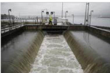
Rainwater and sewage are treated at Owls Head.

The E.P.A., in a statement, said that officials agreed that overflows posed a "significant environmental and human health problem, and significantly reducing or eliminating such overflows has been a priority for E.P.A. enforcement since the mid-1990s."